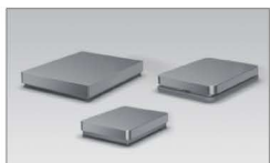
Various Platform Size